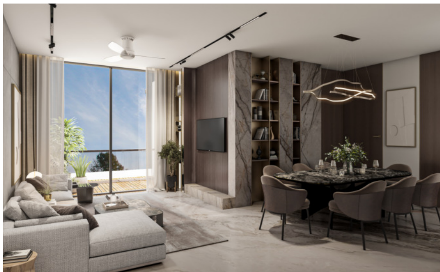
Mivan Construction is known for its innovative construction techniques, particularly in the use of aluminum formwork systems. This method allows for faster construction times and improved quality in concrete structures. Mivan has been involved in various large-scale projects, including residential, commercial, and infrastructure developments, often emphasizing sustainability and efficiency.

Abhyudaya Celestial is constructed using the highest standards of materials and design, ensuring long-lasting quality and safety. Key specifications include: