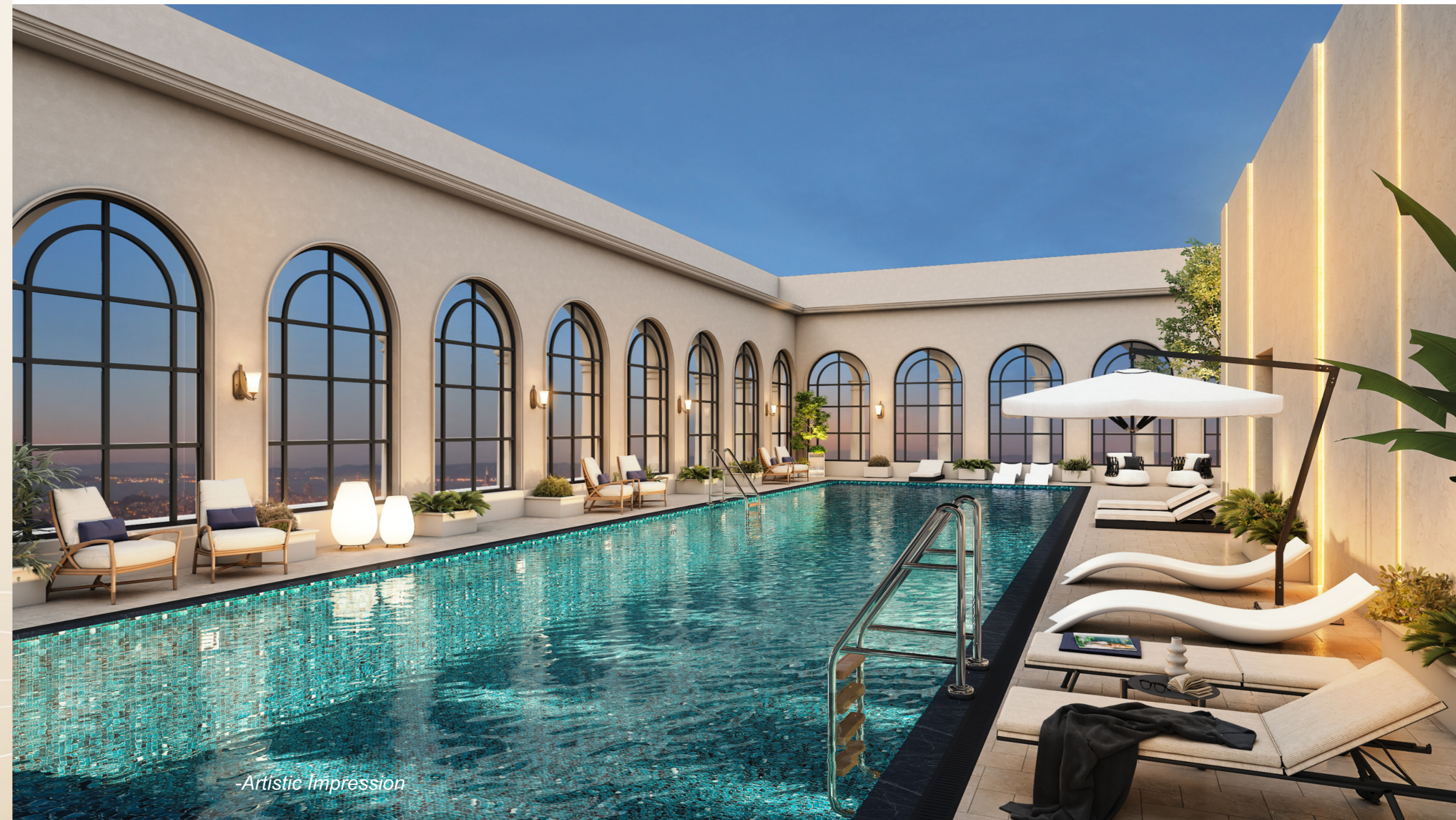
SWIMMING POOL ON 30TH FLOOR

Discover ultimate relaxation at Celestial's stunning terrace swimming pool on 30th floor . Whether you're taking a refreshing dip under the sun or enjoying a tranquil evening by the water, this elevated retreat offers a serene escape with breathtaking views. Experience leisure at its finest, right above the city.